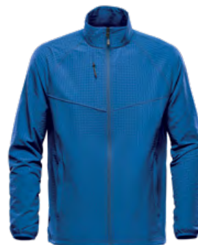
M'S: CLASSIC BLUE