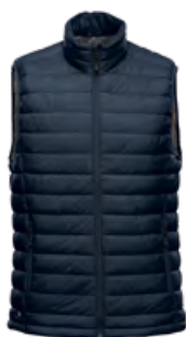
M'S & W'S: NAVY/GRAPHITE