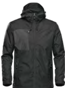
M'S & W'S: BLACK/BLACK