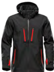
M'S: BLACK/ BRIGHT RED