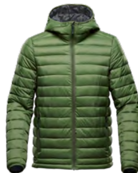
M'S: GARDEN GREEN/ GRAPHITE