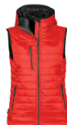
W'S: TRUE RED/BLACK