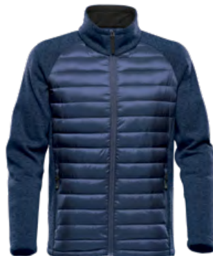
M'S & W'S: INDIGO/INDIGO HEATHER