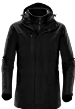
M'S & W'S: BLACK LINER: BLACK