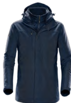
M'S & W'S: NAVY TWILL LINER: BLACK