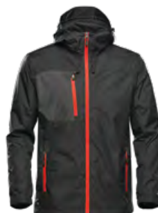
M'S & W'S: BLACK/BRIGHT RED