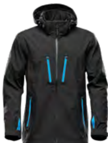
M'S: BLACK/ ELECTRIC BLUE