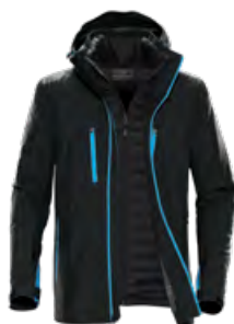
M'S: BLACK/ELECTRIC BLUE LINER: BLACK