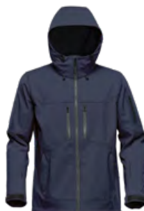
M'S & W'S: NAVY/GRAPHITE