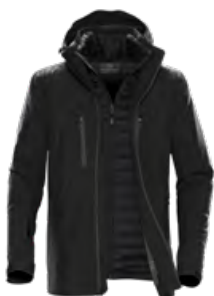
M'S & W'S: BLACK/CARBON LINER: BLACK