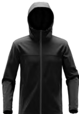
M'S & W'S: BLACK/DOLPHIN