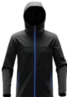
M'S: BLACK/AZURE BLUE