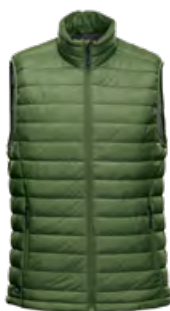
M'S: GARDEN GREEN/ GRAPHITE