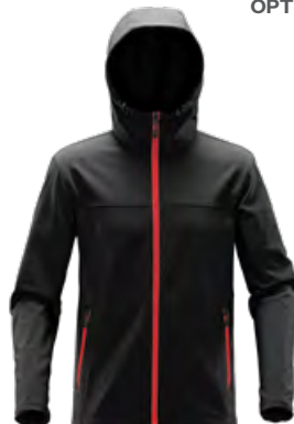
M'S: BLACK/BRIGHT RED