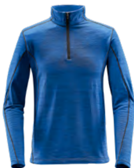
M'S & W'S: OCEAN