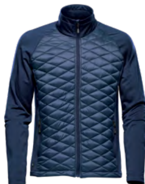
M'S & W'S: INDIGO