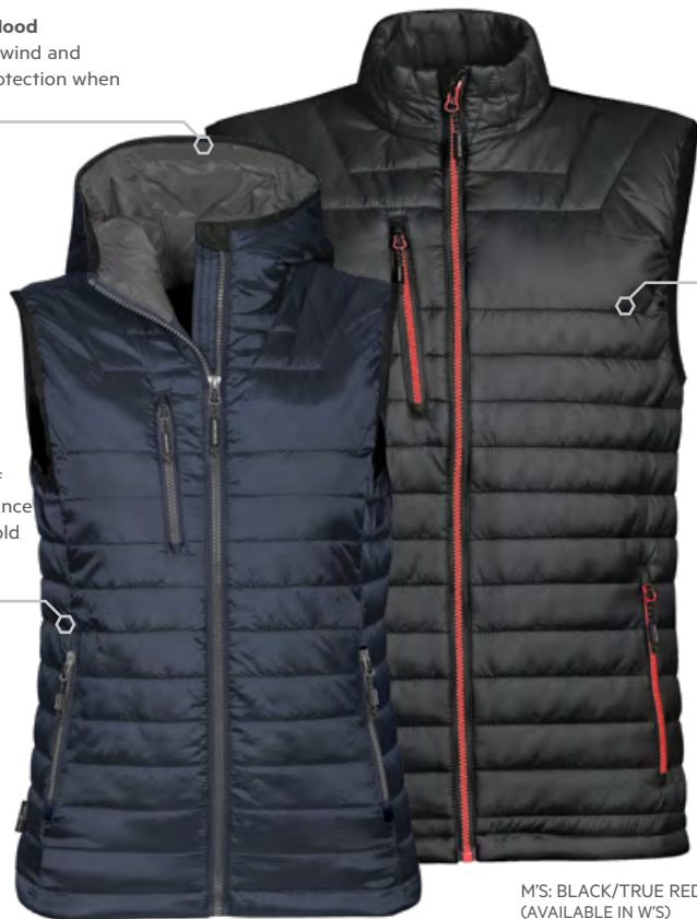
W'S: NAVY/CHARCOAL (AVAILABLE IN M'S)

Provides an all-you-need basic level of water resistance for cool to cold wet weather conditions