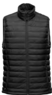
M'S & W'S: BLACK/GRAPHITE