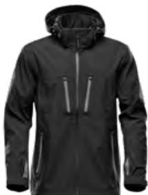
M'S & W'S: BLACK/CARBON