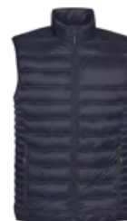
M'S & W'S: NAVY