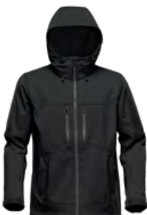
M'S & W'S: BLACK/GRAPHITE