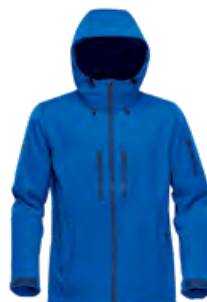
M'S: AZURE BLUE