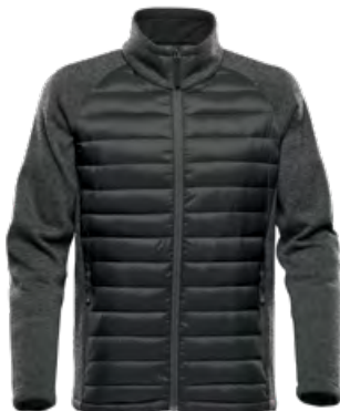
M'S & W'S: BLACK/DOLPHIN HEATHER