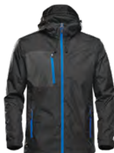
M'S & W'S: BLACK/AZURE BLUE