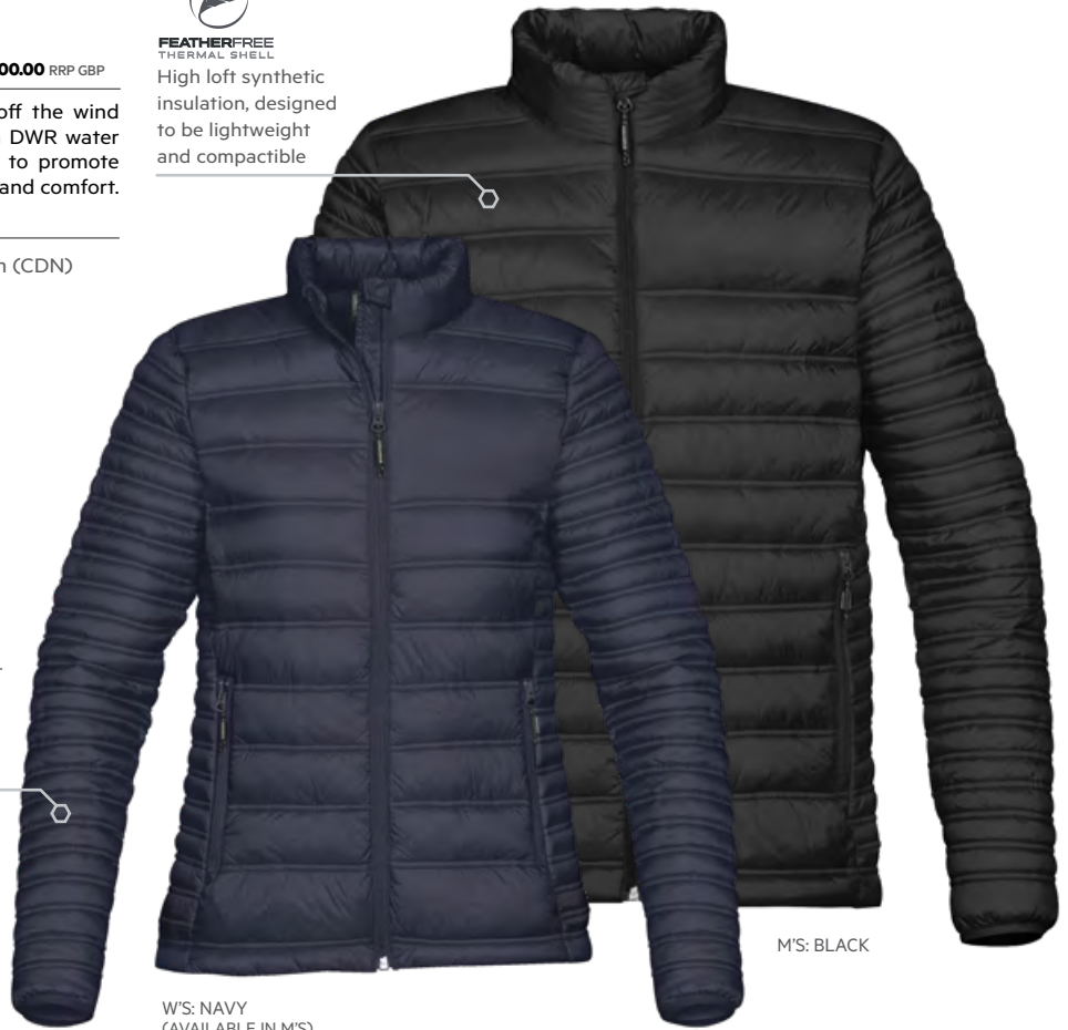
W'S: NAVY (AVAILABLE IN M'S)

High loft synthetic insulation, designed to be lightweight and compactible