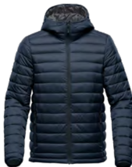
M'S & W'S: NAVY/GRAPHITE