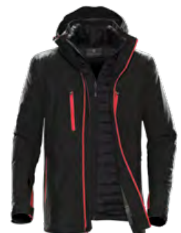
ZIP-IN/ ZIP-OUT LINER