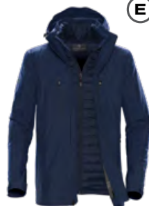
M'S & W'S: NAVY/NAVY LINER: NAVY