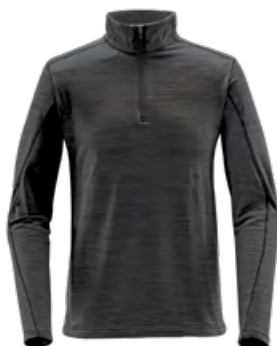
M'S & W'S: DOLPHIN