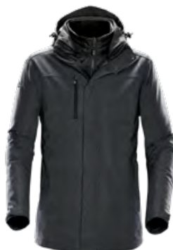
M'S & W'S: CHARCOAL TWILL LINER: BLACK