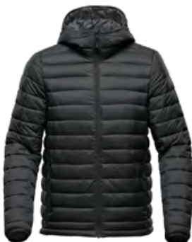
M'S & W'S: BLACK/GRAPHITE