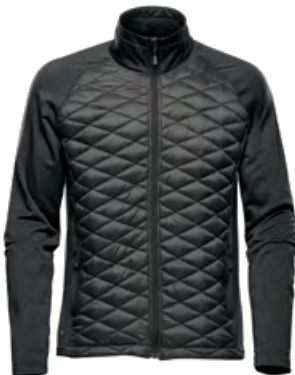
M'S & W'S: BLACK