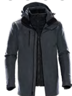
ZIP-IN/ ZIP-OUT LINER