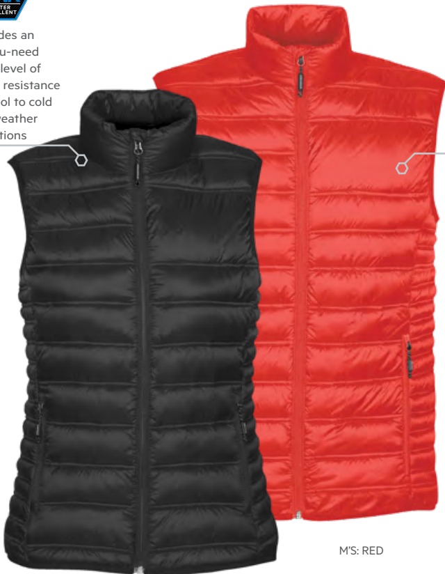
W'S: BLACK (AVAILABLE IN M'S)

Provides an all-you-need basic level of water resistance for cool to cold wet weather conditions