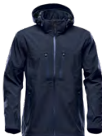
M'S & W'S: NAVY/NAVY