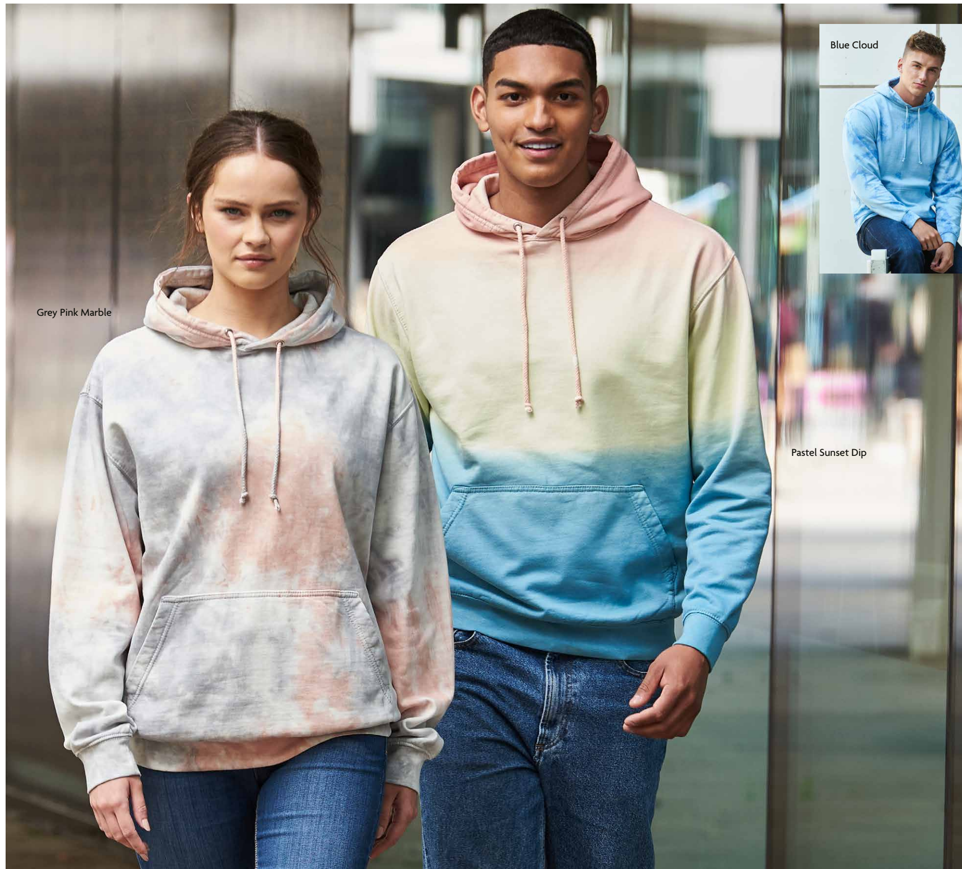
Grey Pink Marble